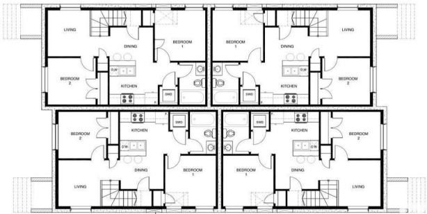
BASEMENT SUITE FLOOR PLAN 548 SQ. FT. / UNIT