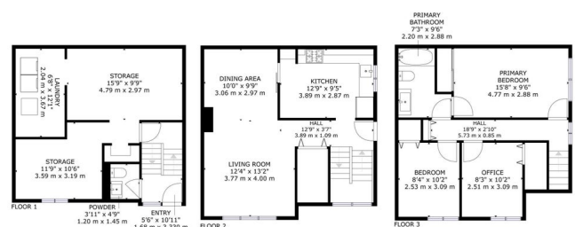
26 MCLEOD PLACE CASSELMAN EDMONTON

GROSS INTERNAL AREA FLOOR 1: 473 sq.ft, 44 m 2 ; FLOOR 2: 506 sq.ft, 47 m 2 ; FLOOR 3: 506 sq.ft, 47 m 2 TOTAL: 1485 sq.ft, 138 m 2